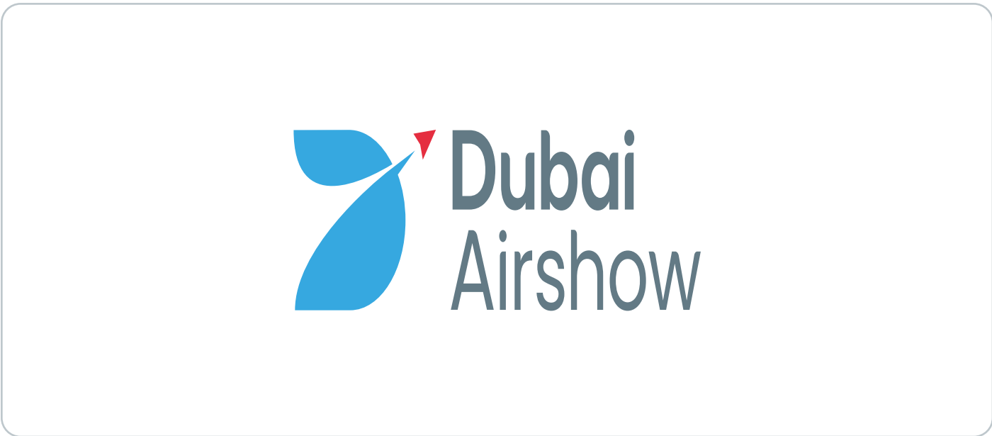
DO NOT distort the logo