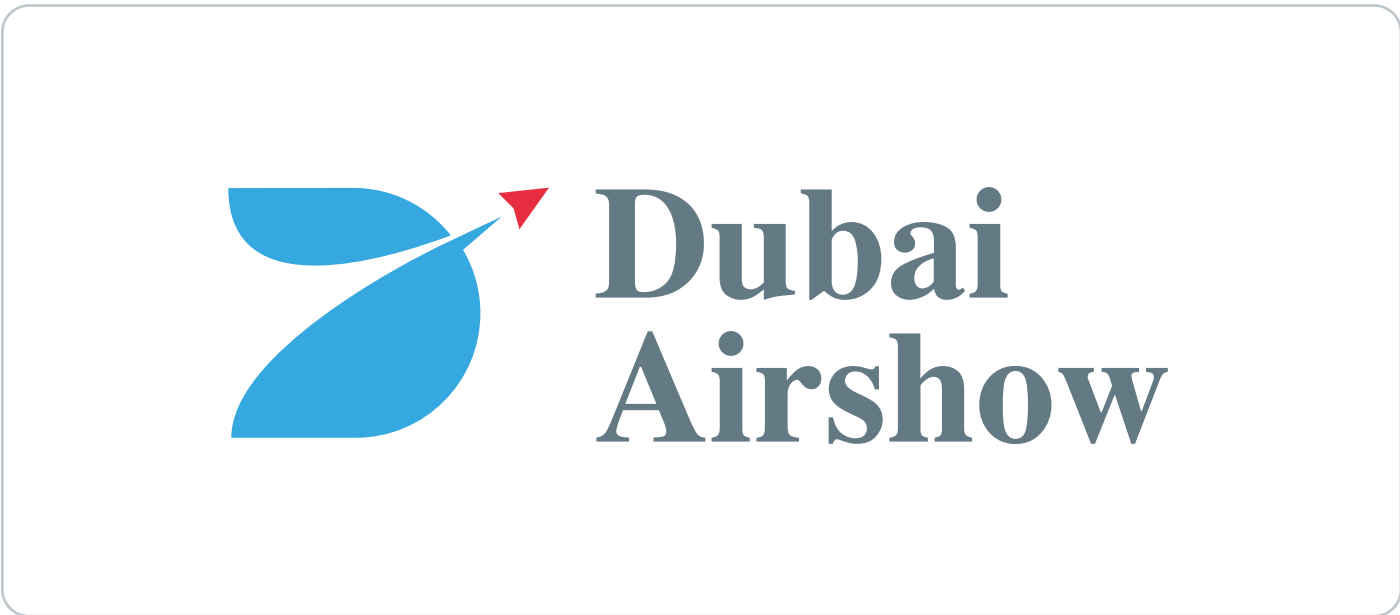
DO NOT change the typeface in the logo