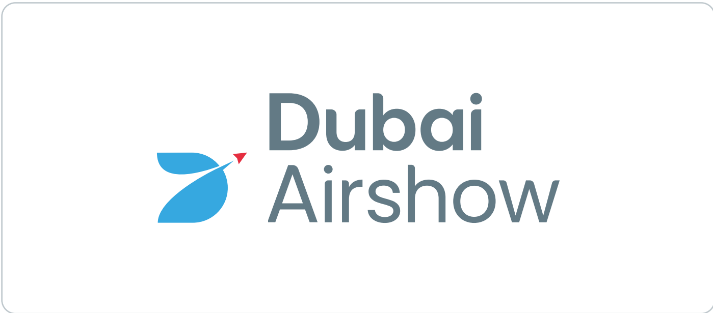
DO NOT change the proportions of the logo