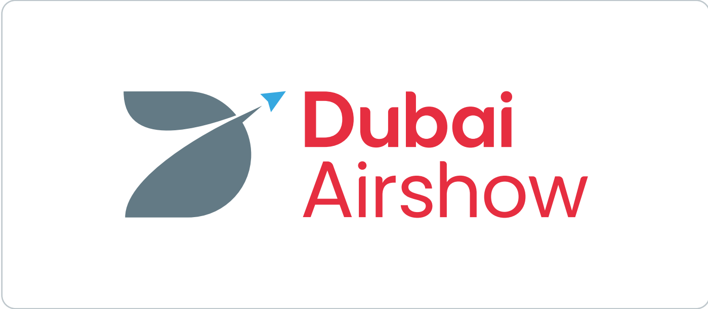
DO NOT change the logo mark or type colours