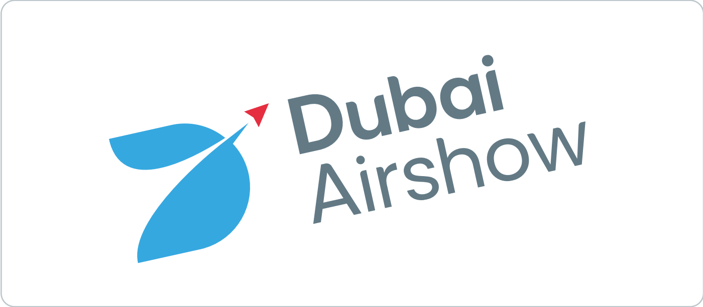
DO NOT rotate the logo